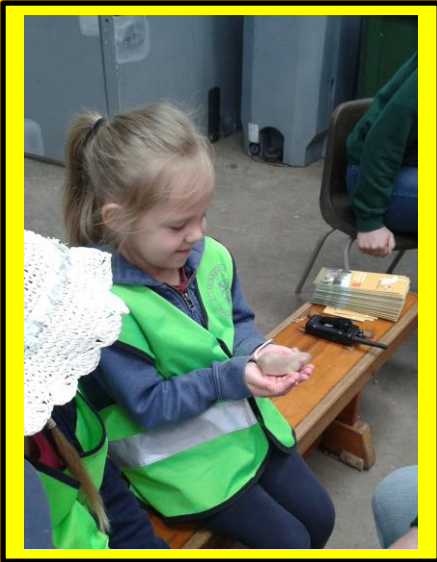
We held or stroked a chick, mouse and a Guinee pig.