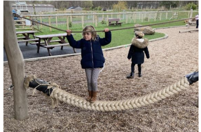
Y5/6 - Crich Tramway Museum