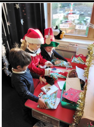
Getting into the festive spirit