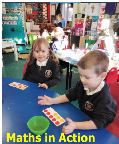
Maths in Action

The children have really enjoyed being time detectives and learning all about the past. They sang well and Tesco as part of our community link and they have been busy creating some Christmas crafts which they will be bringing home.