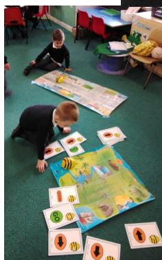
Being Time Detectives